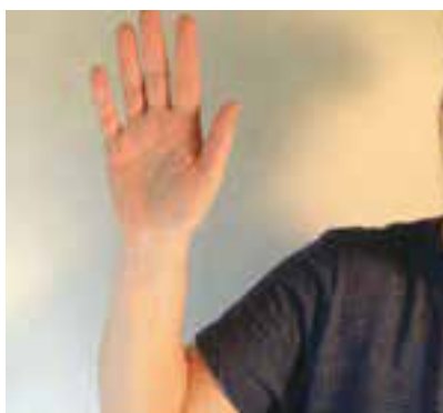
SESSION 7: DAUGHTER MARCH 2013