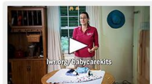
Tips & Tricks video about assembling Baby Care Kits