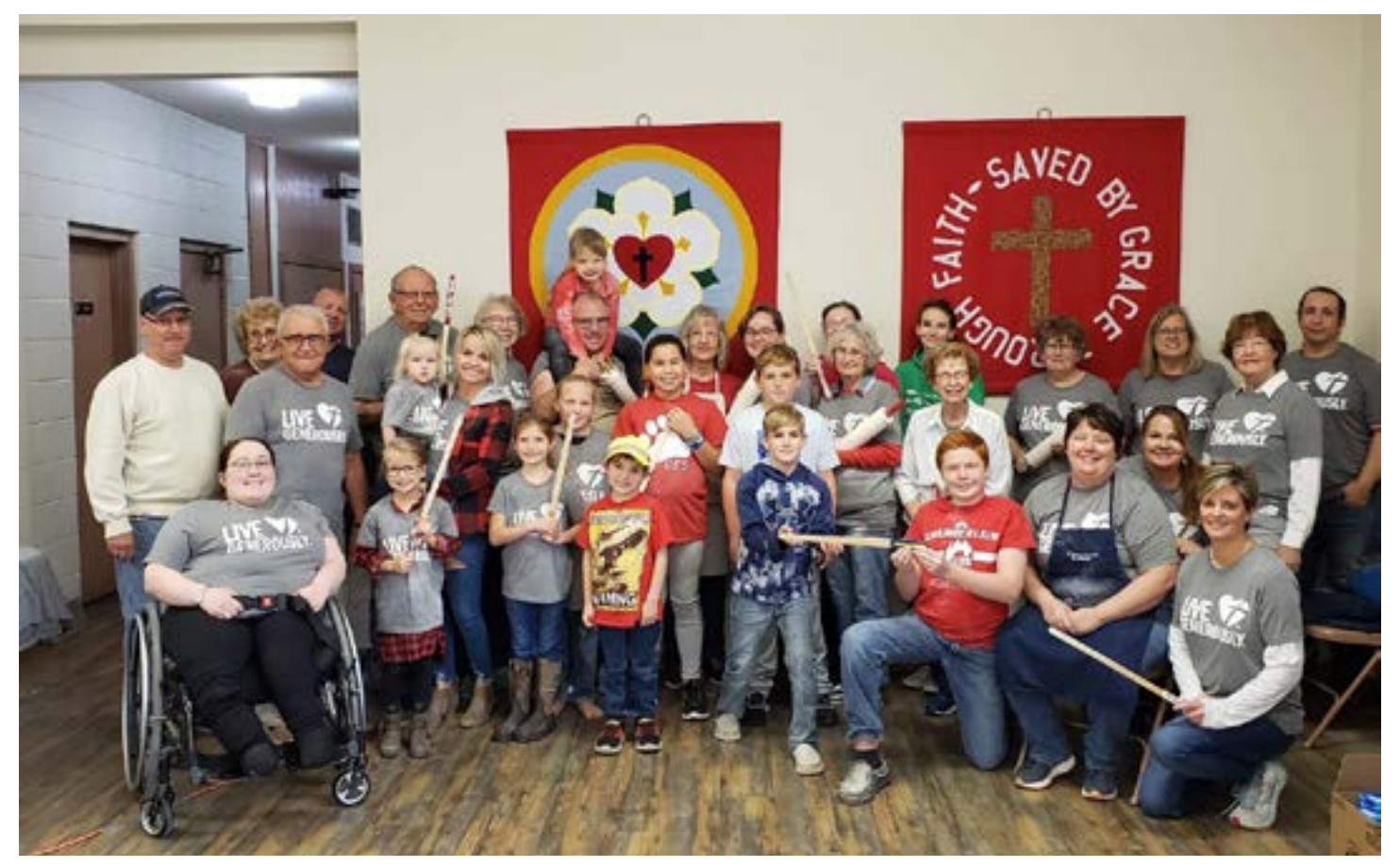
What an awesome group of people (and at least 5 are missing)!! Church members of all ages worked to make 105 dozen of lefse for the upcoming supper!! The day was a huge success!! A huge thank you to the dough making crew and to the Rasmussen's who took 2 bags of dough home to finish the project.