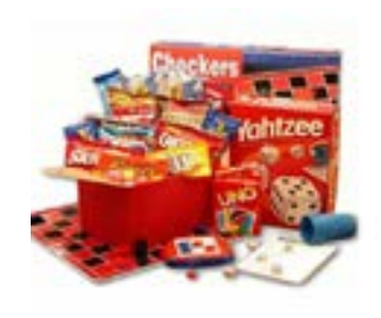
11. Game Night Raffie Basket